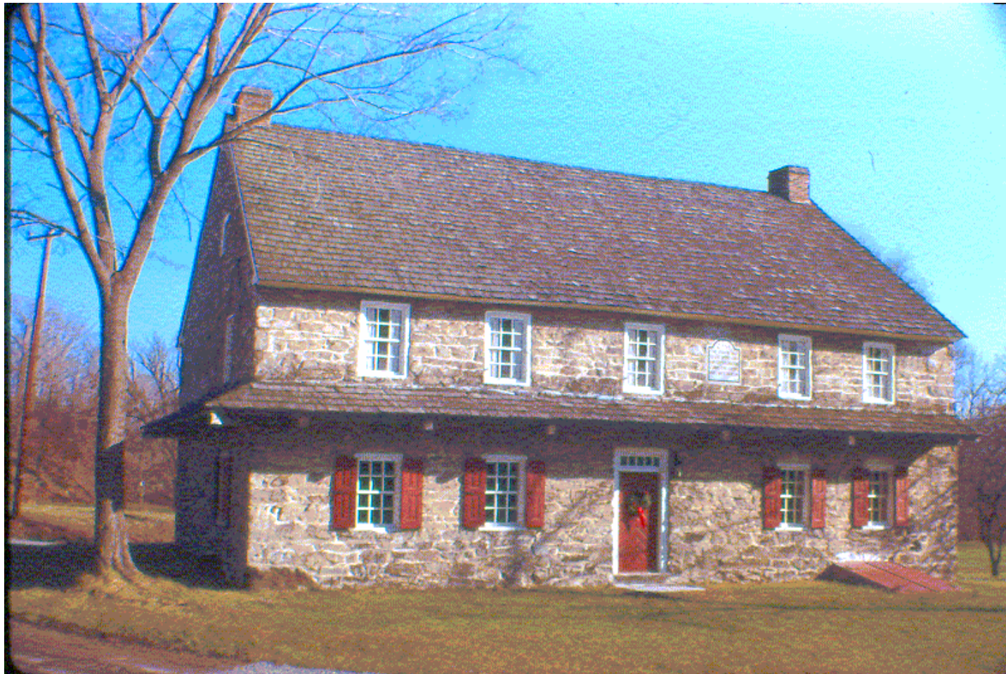
Troxell house – Egypt, PA