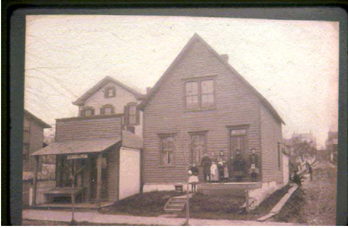
2 nd St.