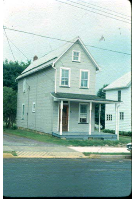
8 th St.